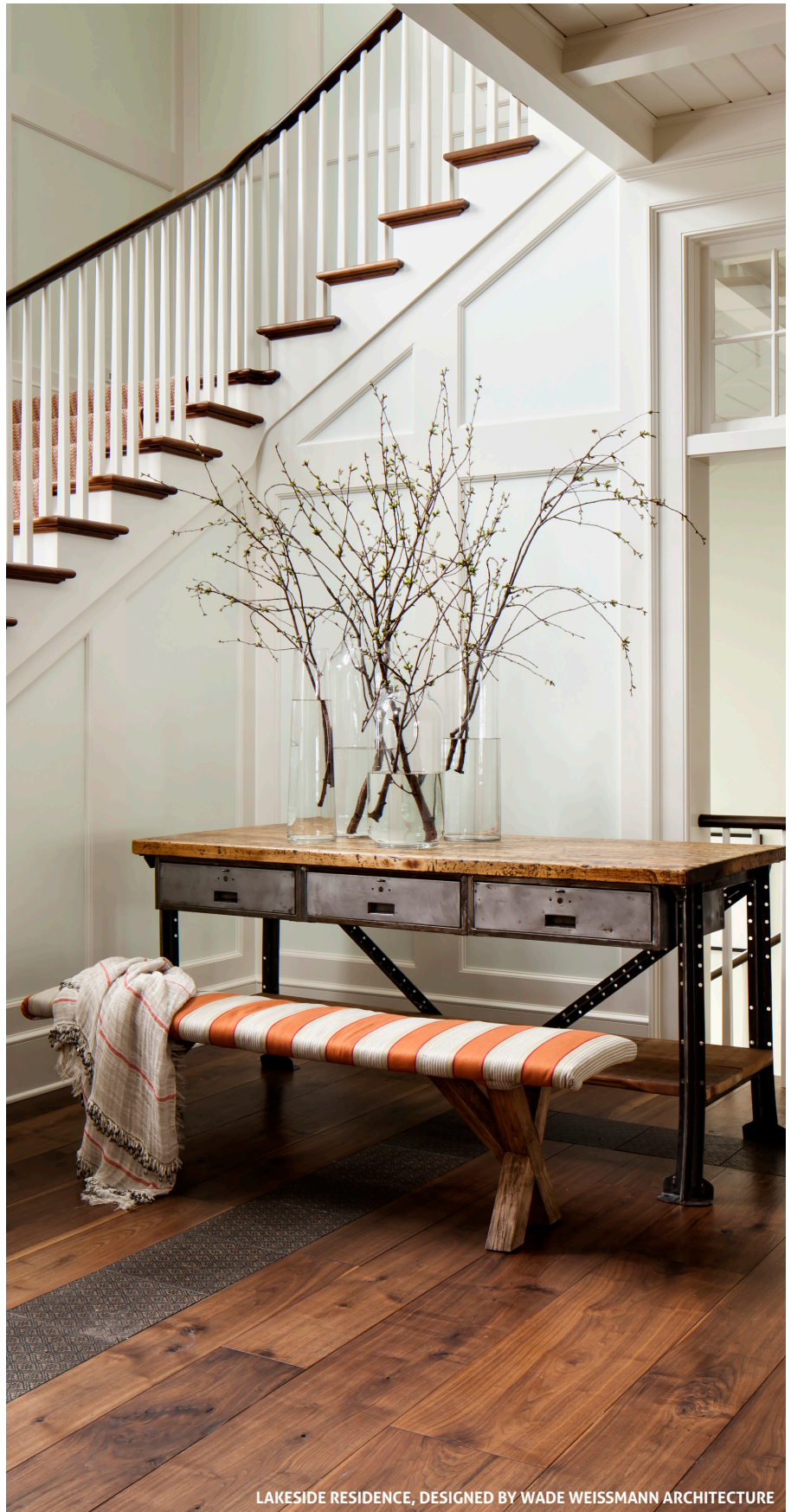
LAKESIDE RESIDENCE, DESIGNED BY WADE WEISSMANN ARCHITECTURE

In terms of economic impact, during its $350+ million construction phase, the development is projected to generate 2,500 job-years of full-time employment and more than 5,600 job-years of total region-wide employment.