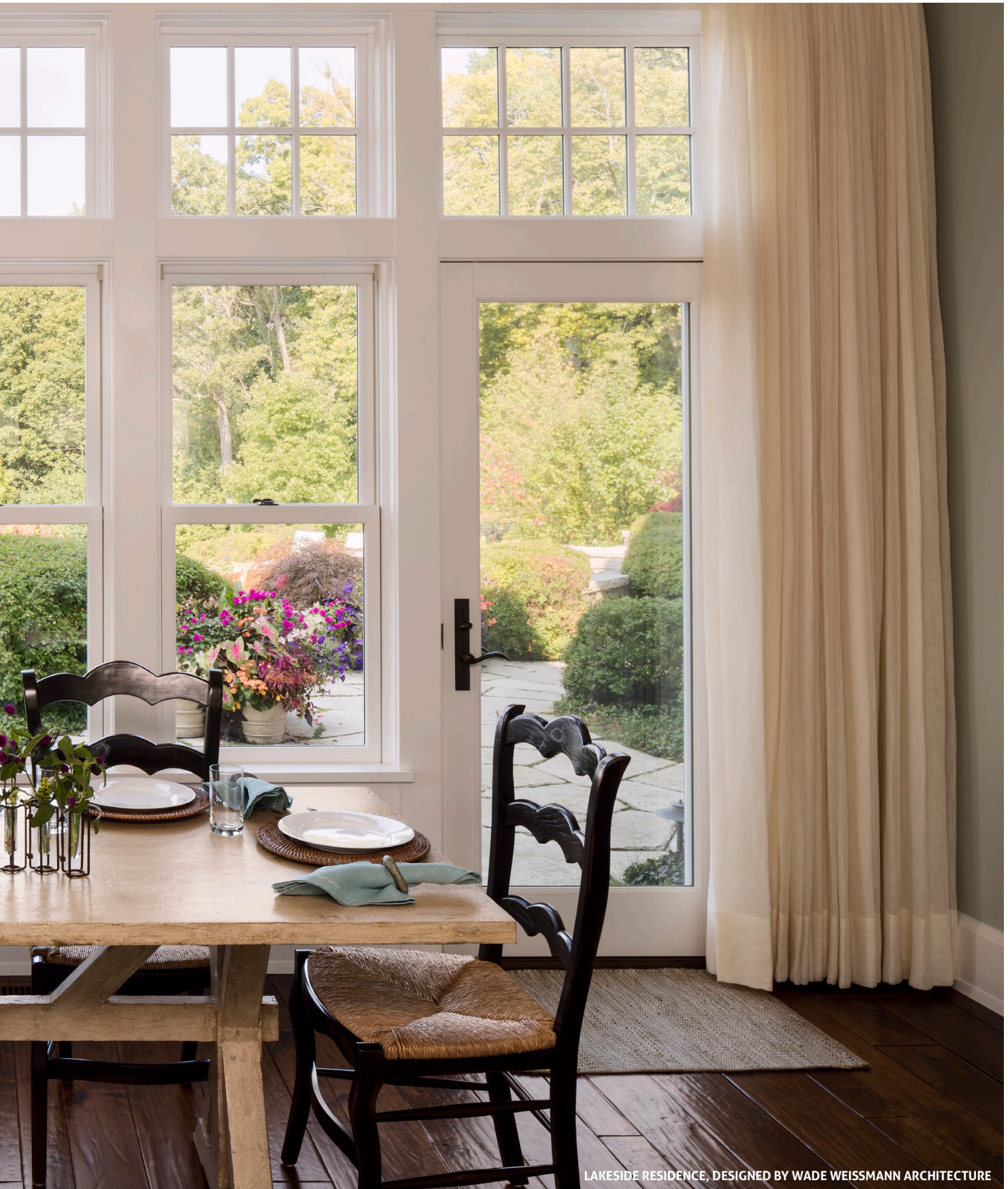
LAKESIDE RESIDENCE, DESIGNED BY WADE WEISSMANN ARCHITECTURE